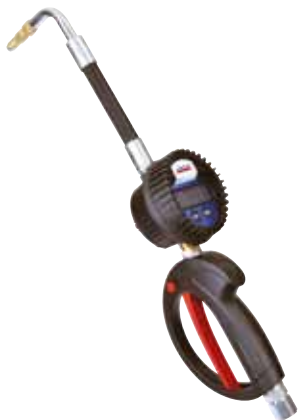
Model 980 electronic lube meter