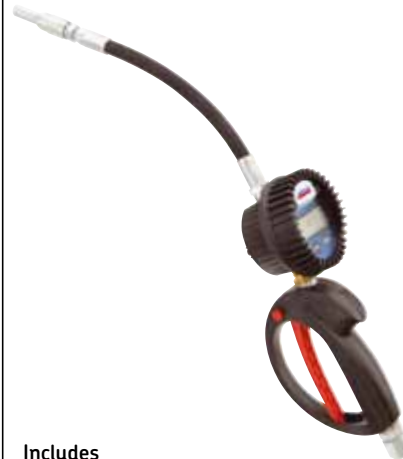
Model 982 electronic lube meter

Control valve, meter, 5.5 in. (14 cm) rigid spout, automatic tip and instruction manual