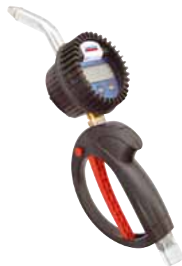
Model 981 electronic lube meter

Control valve, meter, flexible 90° extension, manual tip and instruction manual